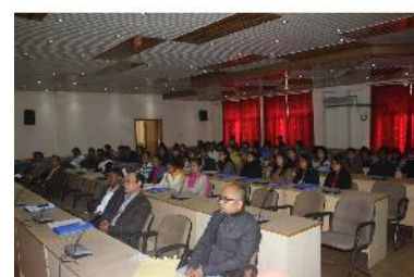
Delegates during the symposium