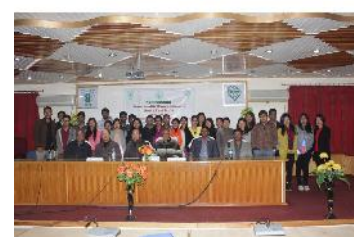
Group photograph during symposium