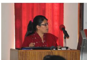
MJN merit academic award contestant (North Eastern Zone)