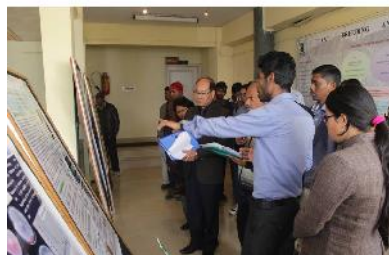
Poster session in progress