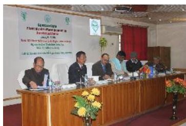
Dignitaries on the dais during inaugural function